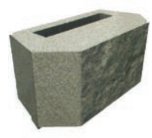
Norfolk Block 390mm x 190m x 180mm 1 sqm wall = 14 blocks 18.5 kg each 90 per pallet Code 020-144